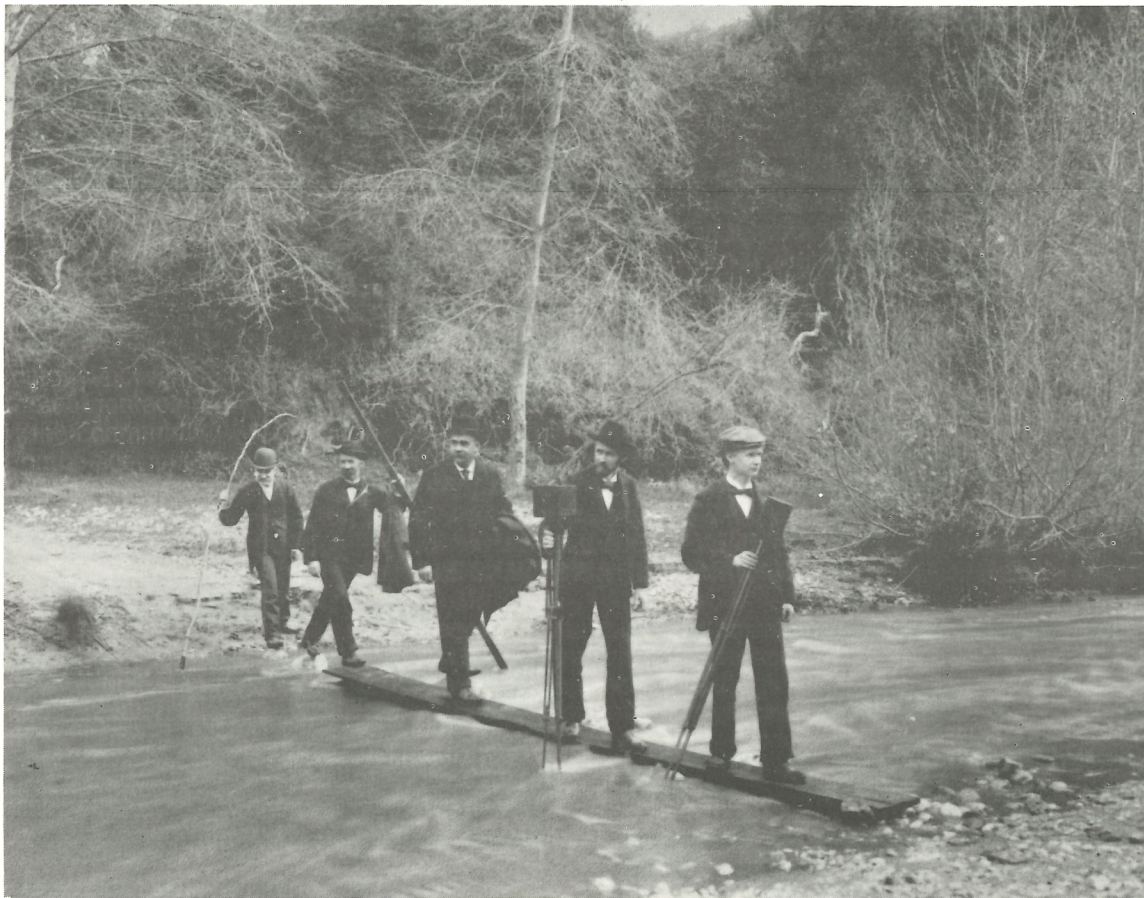
Crossing the Arroyo Seco, 1897.