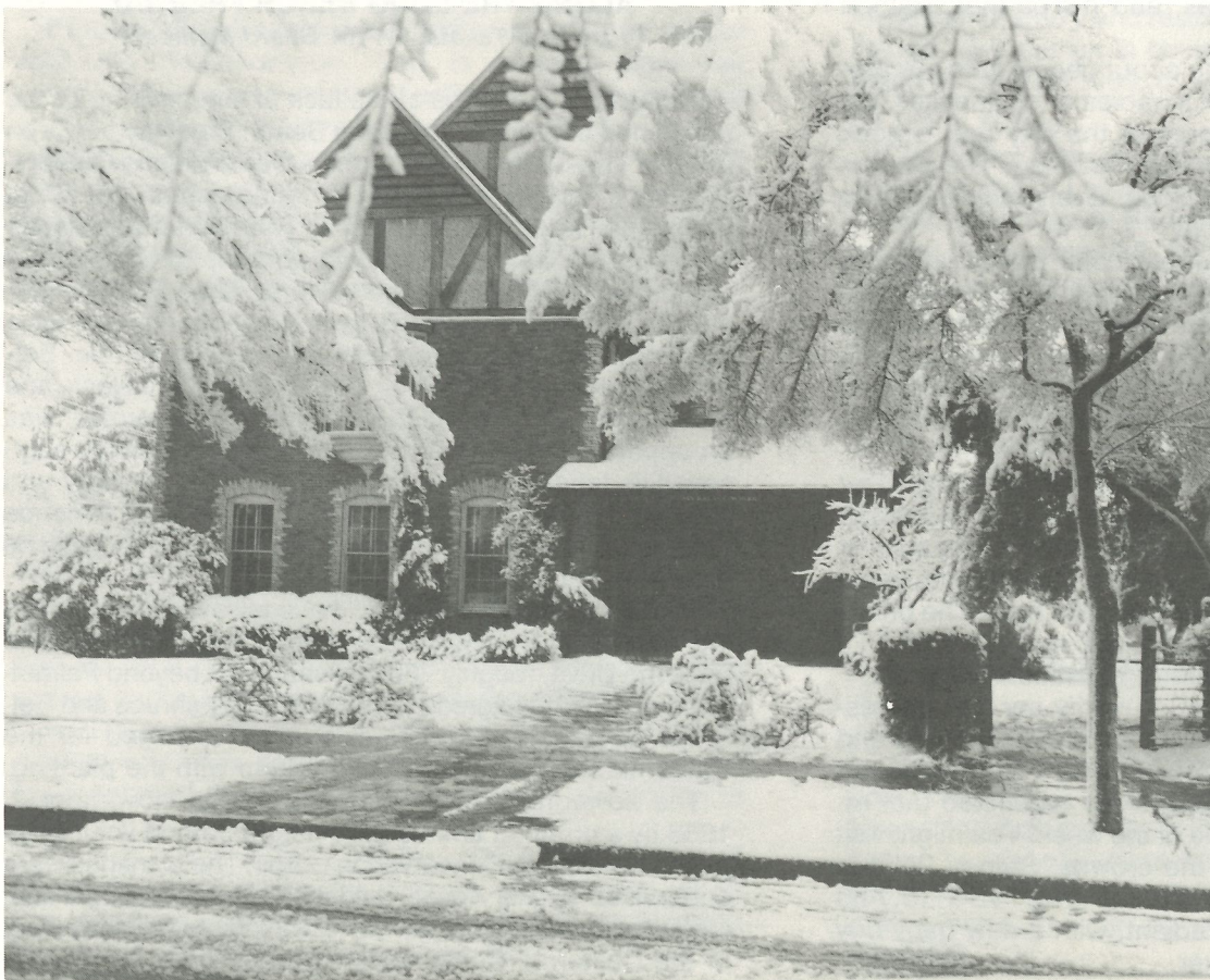
San Rafael Elementary School, 1090 Nithsdale Road, January 11, 1949.

West Pasadena Residents' Association Est. 1962