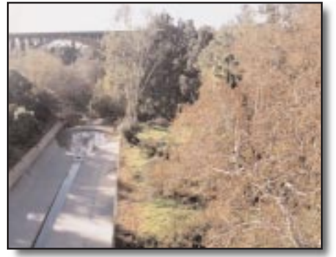
Concrete channel bisects natural space.

Early in January, Pasadena City Staff released preliminary documents recommending the elimination of several controversial components in the Arroyo Seco Master Plan (ASMP), most of the them in the Lower Arroyo Master Plan (LAMP). Items to be removed from the LAMP include the proposed bike path, new parking lot and pedestrian bridge.