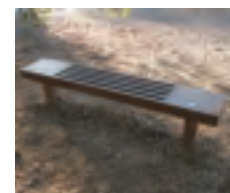
ARROYO SECO BENCH