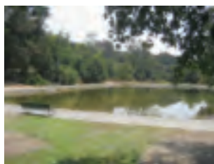
The existing asphalt surface of the pond has proven over time to not be the appropriate material to contain the pond water. It is old and has been deteriorated over time.

Lower Arroyo Seco Master Plan Objectives: • Repair Pond and Resurface Deck • Repair Drainage System • Provide Picnic Area (and other amenities)