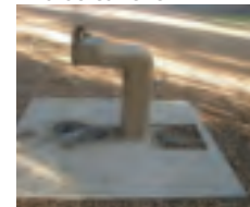
ACCESSIBLE DRINKING FOUNTAIN