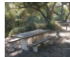
ARROYO SECO PICNIC TABLE

POND SECTION: The old asphalt will remain and be sealed with a neoprene membrane and 4 inches of shotcrete, which has proven at other locations, to be very effective water conservation materials. A new curb with decomposed granite walkway and concrete casting stations will complement the natural surroundings.